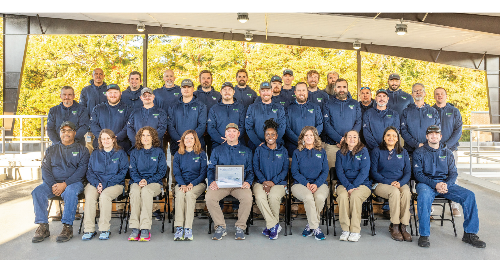
GUC was awarded its 8th consecutive Area Wide Optimization Award and the Partnership for Safe Water Directors Award in 2023.